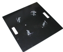
24" Steel 8mm Truss Base Plate for F34 F32 F31 Conical Square Truss with Connectors Black Finish SKU: XT-BP2424S