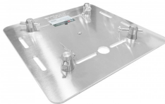
16" Aluminum 6mm Truss Base Plate for F34 F32 F31 Conical Square Truss with Connectors SKU: XT-BP16A