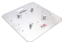
24" x 24" 8mm Aluminum Base Plate F34 Trussing Includes Conical Connectors SKU: XT-BP2424A