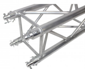
8.20 Ft. 2.50 M F34 Square Truss Segment | 2 mm Wall SKU: XT-SQ820