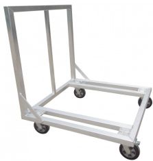
Rolling Stage Dolly Cart Fits up to (8) 4x4 Ft. XSQ Stage Platforms SKU: X-STG-4X4