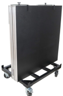
Universal Portable Rolling dolly for 4X4 and 4X8 Ft. Stage Platforms - Supports 6 to 8 Units SKU: X-STGX6