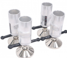
StageQ Leg for XSQ Staging 8 Inch | 2 Inch Tubing SKU: XSQ-8