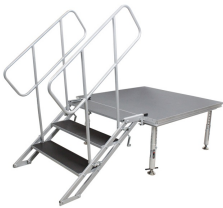
StageQ 3 Step Heavy Duty Foldable Adjustable 18 to 28 Inch with Rail SKU: XSQ-ST3