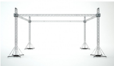
Stage Flat Roofing System Package With 4 Chain Hoists | 40 Ft W x 30 Ft L x 23 Ft H SKU: XTP-GS403023