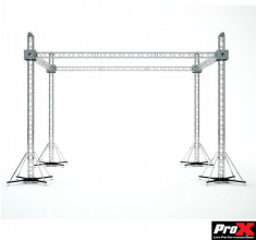
Stage Flat Roofing System Package With 4 Chain Hoists | 30 Ft W x 20 Ft L x 23 Ft H SKU: XTP-GS302023