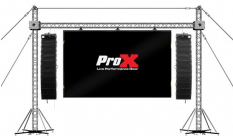
LED Screen Display Panel Video Fly Wall Truss Ground Support System 30'W x 23'H with Hoist SKU: XTP-GS3023