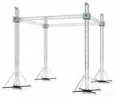
F34 Stage Roofing Truss System with Ground Support and Chain Hoists – 20x20x23 Ft. SKU: XTP-GS202023