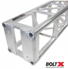
6' Ft. BoltX 12" inch Professional Box Truss Segment | 3mm Wall SKU: XT-BT1206