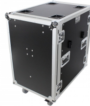
16U Space Amp Rack Mount ATA Flight Case | 24" Depth | Incl. 2x Side Tables and Casters SKU: T- 16RSS24WDST