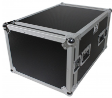
8U Space Amp Rack Mount ATA Flight Case 24 Inch Depth SKU: T-8RSS24