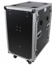
18U Space Amp Rack Mount ATA Flight Case 24 Inch Depth W-Casters SKU: T- 18RSS24WDST