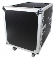
12U Space Amp Rack Mount ATA Flight Case 24 Inch Depth W-Casters SKU: T-12RSS24