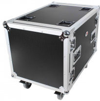
10U Space Rack Mount Flight Case 24 Inch Depth W- Casters SKU: T-10RSS24