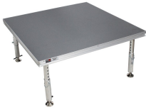
StageQ 4' x 4' Single Stage Unit Height Adjustable from 28 to 48" in. SKU: XSQ-4X4MK2