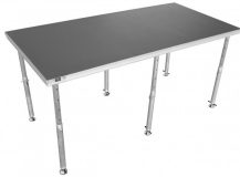
StageQMK3 4 x 8 FT Single Portable Stage Unit Height (6) Adjustable Legs from 28 to 48 in. SKU: XSQ-4X8MK3