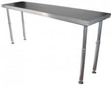
StageQ 2' x 8' Single Stage Unit Height Adjustable from 28 to 48" in. SKU: XSQ-2X8MK2