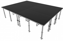
12FT x 24FT SKU: XSQ-12x16PKG48