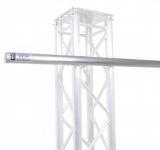
40 inch Truss Mounting Pole Extension Pole for Mounting Stage Lighting and more SKU: XT-DC40