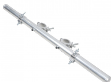
42-90 inch LED LCD Plasma TV Monitor Screen Display Mount for F34 F33 F32 F31 Bolted 12 inch Truss Segments SKU: XT-PLASMA MK2