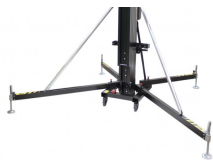
Top Loading Lifting tower - Capacity 496 lbs Max Height 17 ft - Made in Spain by Fantek SKU: XTF-T105D