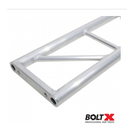
4 FT I-Beam 12" Bolted Box Pro Truss Segment 3mm SKU: XT-BTD1204