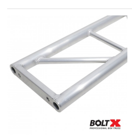
8 FT I-Beam 12" Bolted Box Pro Truss Segment 3mm SKU: XT-BTD1208