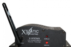
ALCON Wireless Transmit and Receive Unit SKU: X-WSDMX