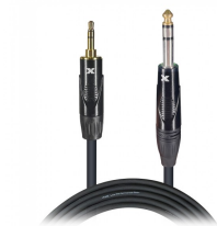
10 Ft. Balanced TRS-M Mini 1/8\" to TRS-M High Performance Audio Cable SKU: XC-MS10