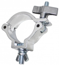
Aluminum Slim M10 O-Clamp with Big Wing Knob for 2" Truss Tube Capacity 165 lbs. SKU: T-C9H