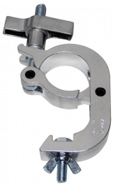
Aluminum Pro Slim Hook Style M10 Clamp with Big Wing Knob for 2" Truss Tube Capacity 330 lbs. SKU: T-C5H