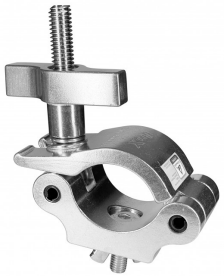
Aluminum Pro M10 O-Clamp with Big Wing for 2" Truss Tube Capacity 1102 lbs. SKU: T-C4H