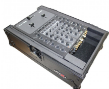
Flight Case for Large Format 10 In. DJ Mixers | Black on Black SKU: XS-M10BL