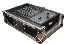
Flight Case for Large Format 10 In. DJ Mixers SKU: XS-M10