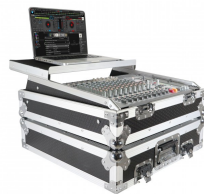
10U Top Mount 19" Slanted Mixer Case SKU: XS-19MIXLT