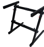
Heavy Duty Z-Stand Keyboard/Case Stand with Adjustable Width and Height SKU: X-ZSTN