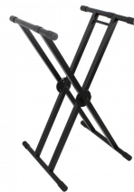
DJ Case/Keyboard Stand Double X Style W/Ergo Easy Lock SKU: X-KSD200