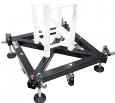
Universal Vertical Tower Truss Ground Support Base on Wheels with Leveling Jacks for F34, F44 and 12" Bolt truss SKU: XT-GSB MK3