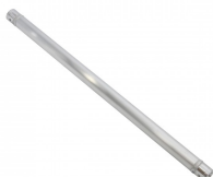
3.28 Foot - 1M F31 Single Tube Truss Segment | 2mm Wall SKU: XT-S328