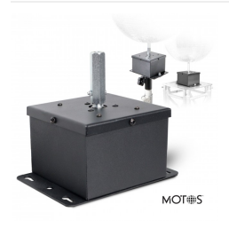
MOTOS Universal Upright Mirror Ball Oscillating 1RPM Motor – Mounts up to 30" Mirror Balls Black Finish SKU: X-MOTOS-BL

Speaker Stand Mounting Plate In White for Speakers and Moving Head SKU: X-SSMPWH