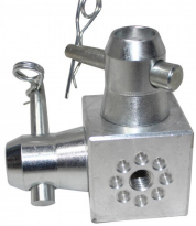
XT-SJB-2W Single Junction Box Includes 2 Sided Connecting Hardware for F34 F33 F32 F31 Truss SKU: XT-SJB-2W