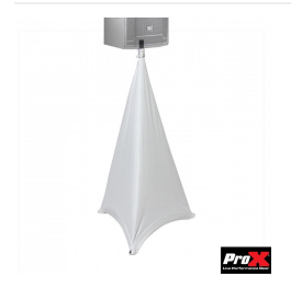
Lycra Cover Scrim for Speaker Tripod or Lighting Stand 2 Sided - White SKU: X-SP2SC-W